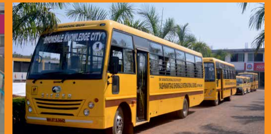
In-house Transport Facility