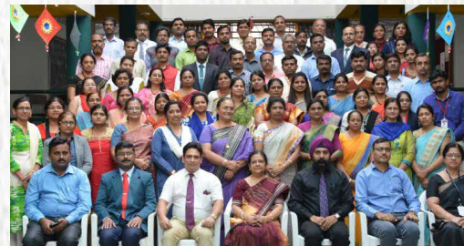
CBSE Workshop for Staff