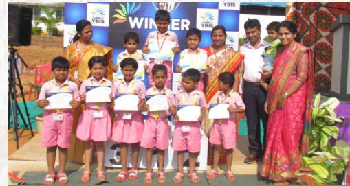
Sr. KG Winners