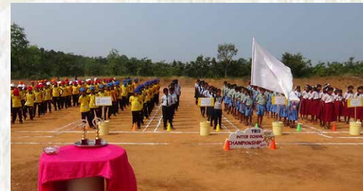
Inter School Kho Kho