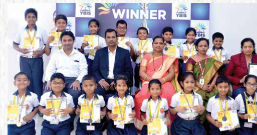
SOF GK Exam