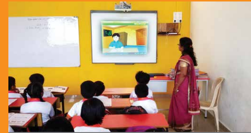
Educomp Smart Classroom