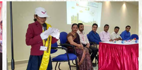
Swachh Bharat Abhiyan