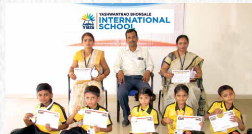
Kshitij Drawing Competition