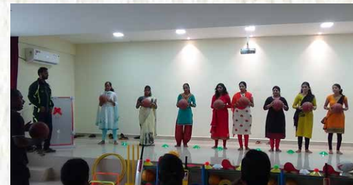
EduSports Parents Workshop