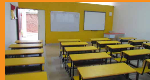
Fully Equipped Classrooms