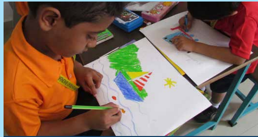
Drawing & Art