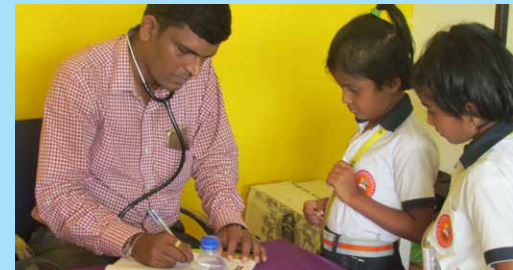
Medical Check up