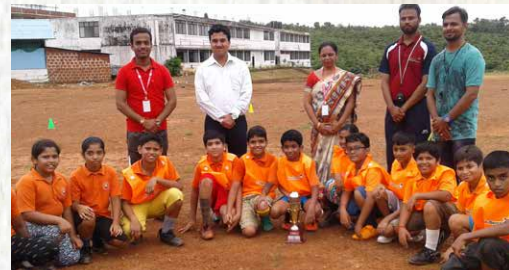
Inter House - Football